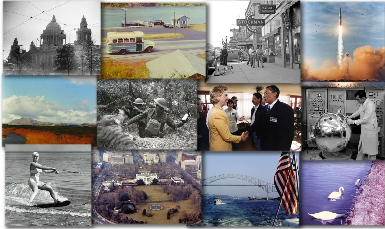
Fig. 1. Some example images from the Date Estimation in the Wild dataset.

regression problem, respectively. Experimental results show the feasibility of the suggested approaches which are superior to annotations of untrained humans.